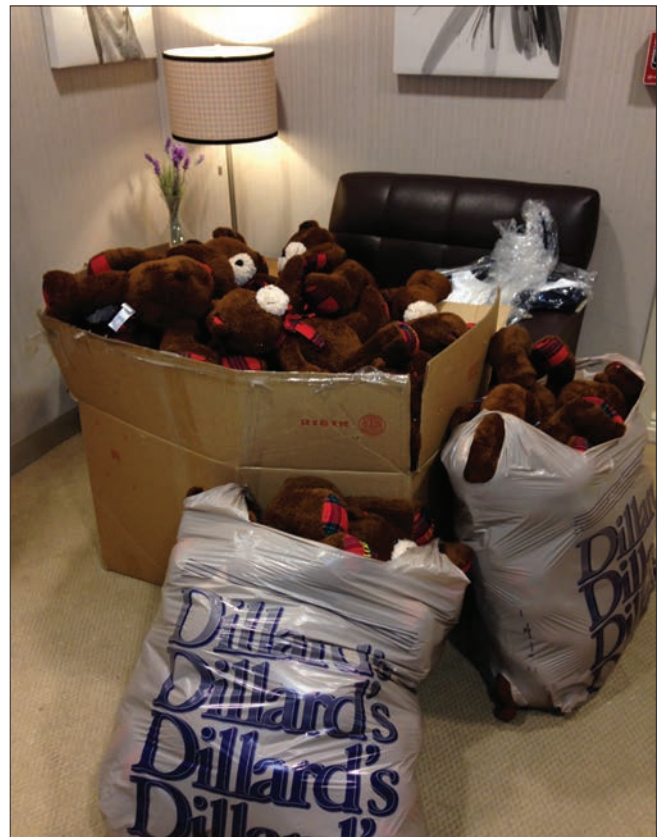
Hundreds of teddy bears, courtesy of Dillard's, were distributed to local nonprofits in the Evansville area with the League's assistance.