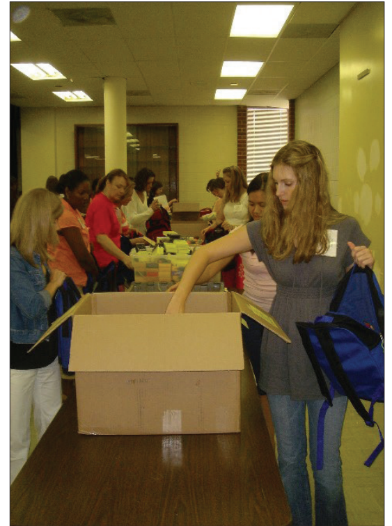
Members of the Junior League of Northern Virginia stuff backpacks with healthy food at a JAMPACKS event. The backpacks are distributed to area children who may otherwise go without food on the weekends.