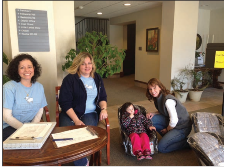
Provisional Members volunteer at Little Lambs of Evansville, an organization that began as one of JLE’s Signature Projects.